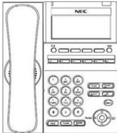
IP Terminal Layout