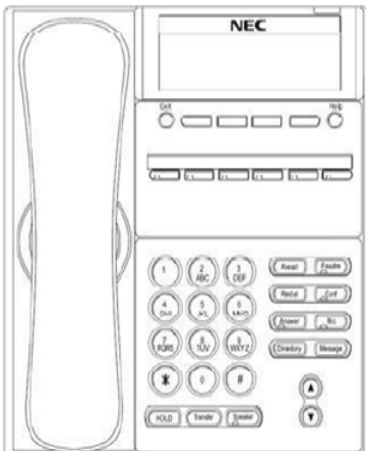
Digital Terminal Layout